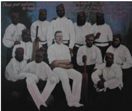
The Invincibles , 2004 acrylic, red ochre & plastic on canvas, 100x120cm