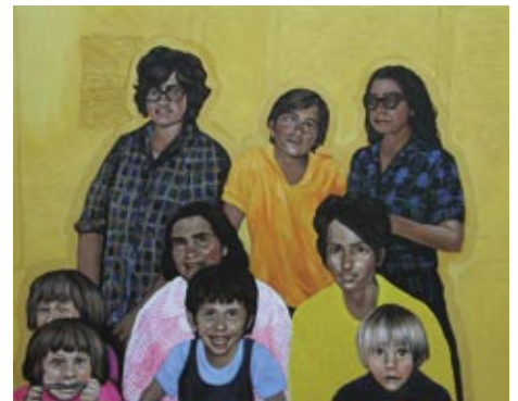
Didn't you know you were aboriginal? , 2004 acrylic & red ochre on canvas, 120x150cm