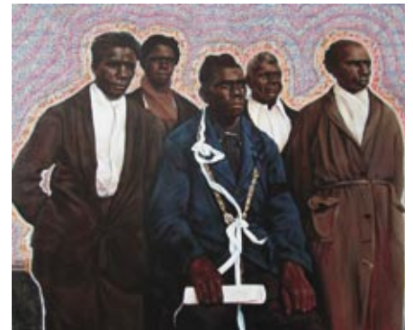
The Citizen King , 2004 acrylic & red ochre on canvas, 100x120cm