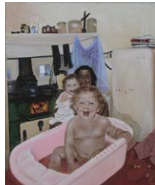
The Boat People , 2004 acrylic, red ochre & plastic on canvas, 120x100cm