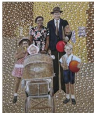
The Gauntlet , 2004 acrylic, red ochre & plastic on canvas, 120x100cm