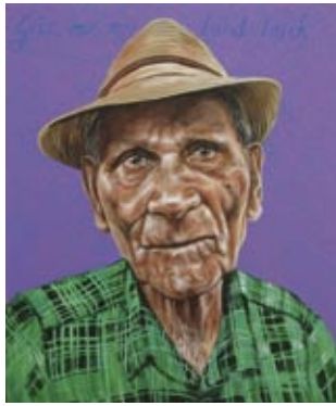
Dispossession Series: My Great Uncle George , 2004 acrylic & red ochre on canvas, 120x100cm