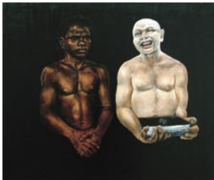
Just because you feel it, doesn't mean it's true! , 2004 acrylic & red ochre on canvas, 100x120cm